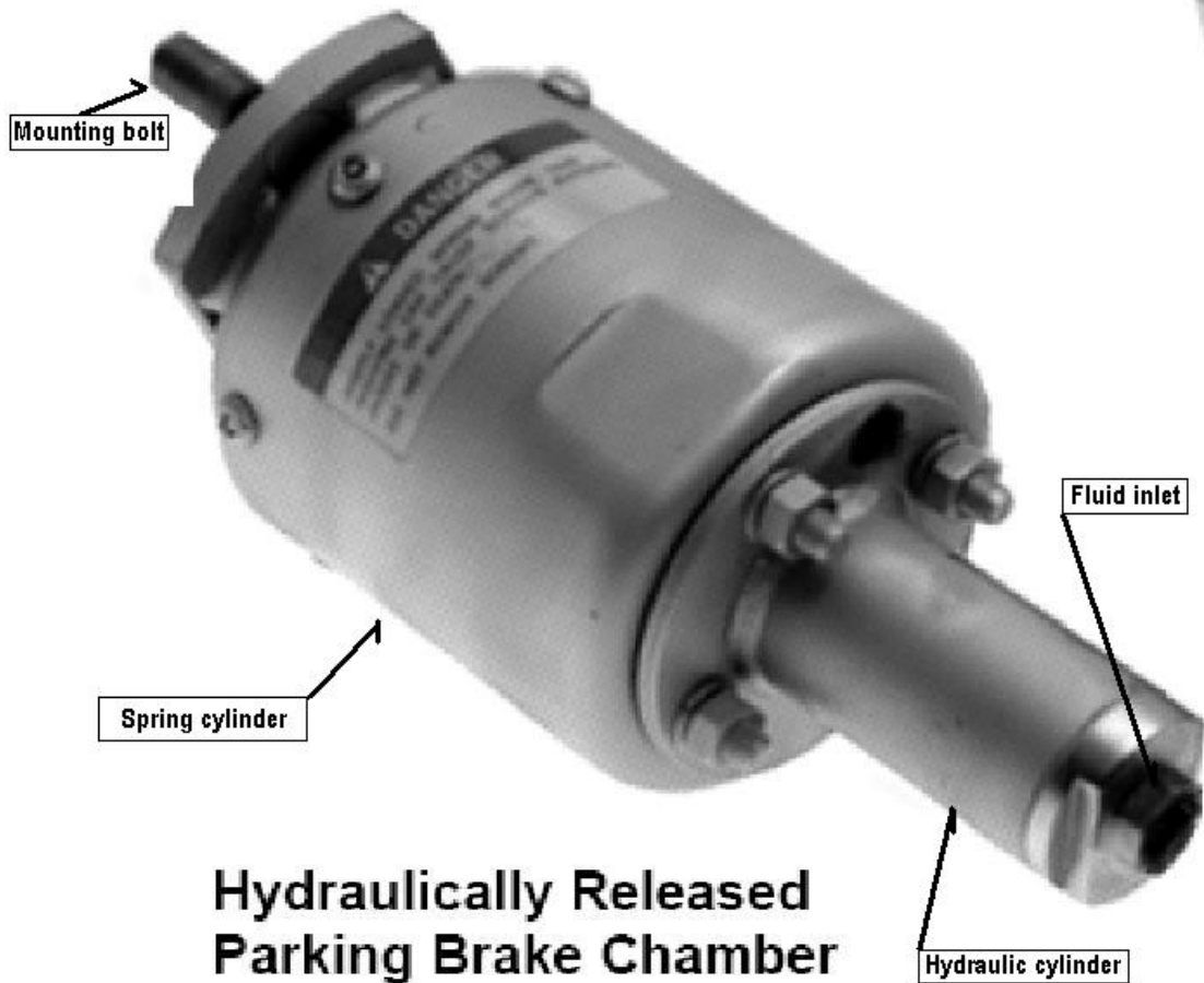
Hydraulically Released Parking Brake Chamber Part Number: N36000B

It is a rare occasion when either of these two Auto Park brake actuators needs to be totally replaced. But, both are subject to failure due to leaking seals.